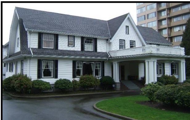
Junior Campus, Robson Manor Junior Kindergarten to Grade 3 101 Third Street