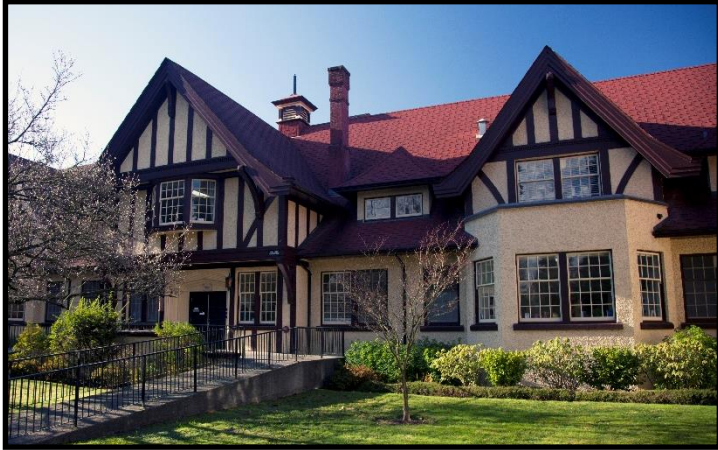
Middle / Senior Campus at Uptown Grade 4 to 12 601 Eighth Avenue

Our school buildings are there to support student learning. We ask all of our students, teachers, staff and parents are asked to respect it as such. Respect for the buildings and resources we have is expected of all of our students.